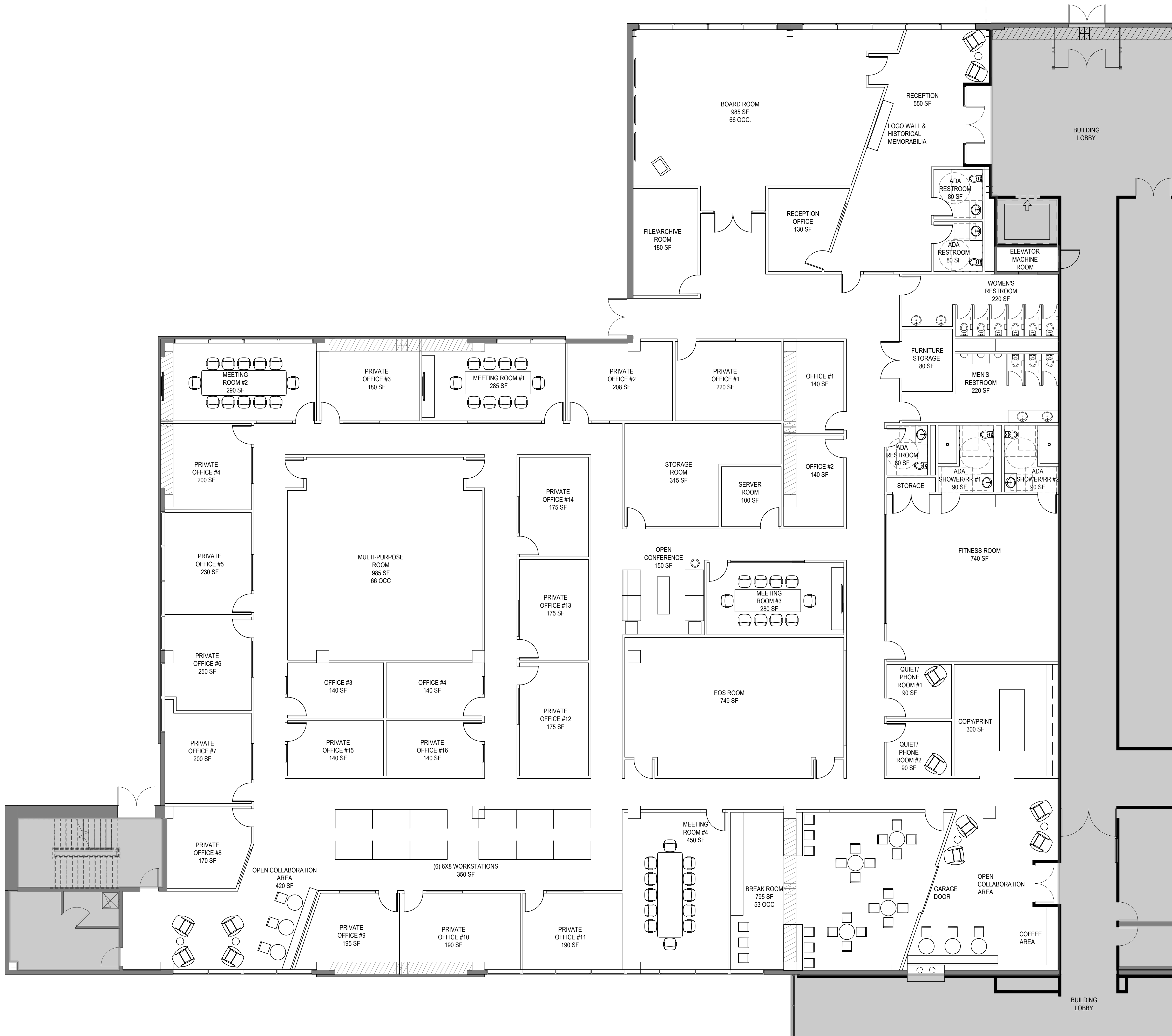
1 SPACE PLAN SUITE 120 | 19,557 RSF Scale: 1/8" = 1'-0"

DESIGNER Md+m MARSHALL DESIGN + MANAGEMENT 12400 SE 38TH #50766 BELLEVUE, WA 98015