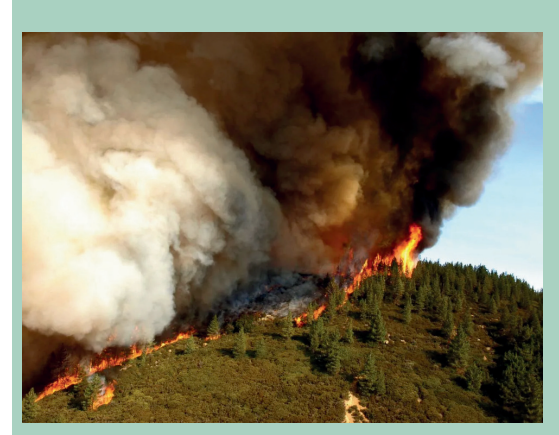
A wildfire burns in southwestern California in 2007.

A wildland fire, or wildfire, is an uncontrolled fire that burns in a forest, grassland, or other sparsely populated area. In the United States and Australia, about 50,000– 60,000 wildfires (also known as bushfires in Australia) burn every year. About 90 percent of wildfires are started by people, either on purpose or by accident. These fires are started by campfires, cigarettes, or other careless behavior. The remaining 10 percent of wildfires are started by lightning or lava.