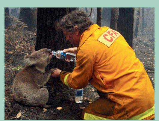
A firefighter shares his water with an injured koala after wildfires in Australia, February 2009.

Wildfires usually begin in the summer, when it is hot and there is little rain. This weather dries out the trees, grass, leaves, and branches. Fires can spread quickly in these fuels. The fires are often hot enough to light heavier fuels, such as tree stumps, heavy tree limbs, and the forest floor. Once these heavy fuels are burning, it is hard to put them out. Drought, heat, and wind can make a wildfire worse.