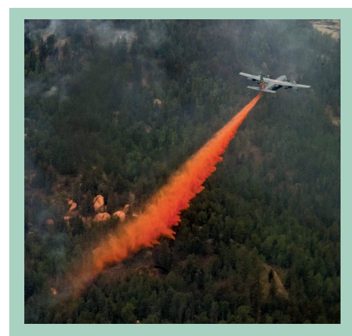
An airplane releases firefighting chemicals on a wildfire in Colorado Springs, Colorado.

Tools for fighting wildland fires include portable pumps, tank trucks, and earth-moving equipment. Aircraft are also very important in fighting wildfires. They are used for dumping water or other chemicals that can slow down or contain wildfires. Airplanes and helicopters are also used for gathering information and for moving people, supplies, and equipment. Smoke jumpers are firefighters who parachute into wildfires in remote areas.